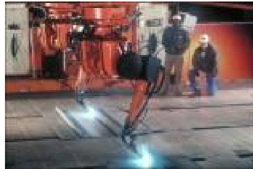
Welding and Other Material Joining Technologies