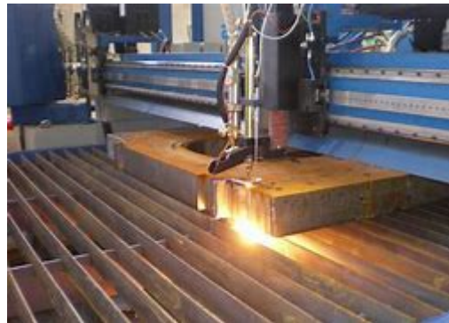
Weld Joint Preparation