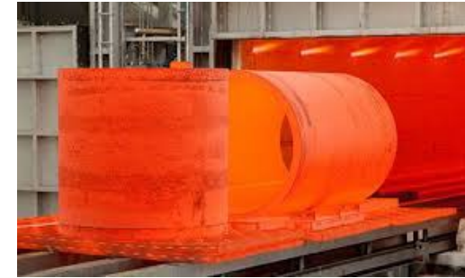
Post Weld Heat Treatment