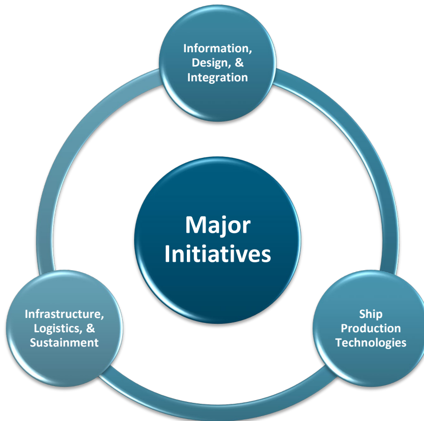
Figure 2 Revised Major Initiative Structure

NSRP has identified three overarching, integrally-connected Major Initiatives that tie the program’s vision to proposed industry research and are derived from the basic organizational structure of a shipyard. The term “Major Initiative,” as used in this document, constitutes operationally-aligned groups of functional topics. The three Major Initiatives shown in Figure 2 above align with the traditional ship lifecycle phases of “Design, Build, and Sustain.” The nine NSRP panels each align to one of these Major Initiative areas. Each panel conducts research and development that is targeted on implementation and focused on specific technology areas of practice. Each Major Initiative group has identified technology development and improvement areas (sub-initiatives). Each of these Major Initiatives and constituent panels will be discussed in greater detail in the following sub-sections.