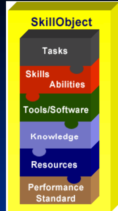
Elements of a specific skill standard