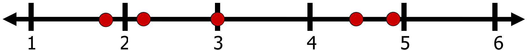
Image (4.9 avg.)