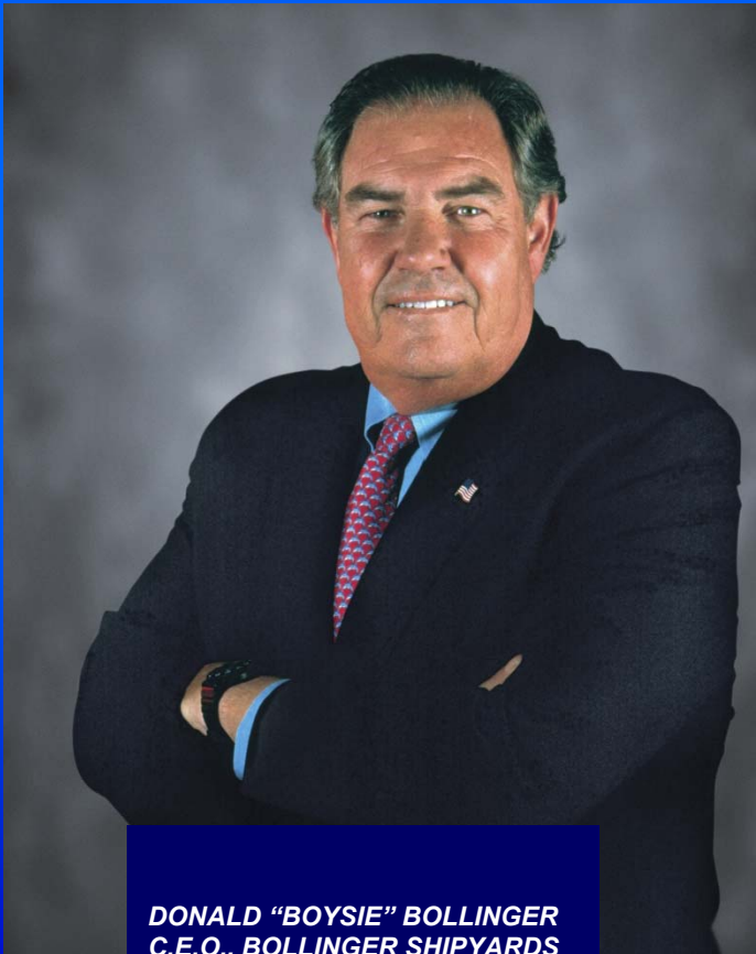
DONALD "BOYSIE" BOLLINGER C.E.O., BOLLINGER SHIPYARDS